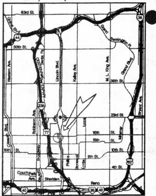
Church Address: 504 NE 16th St.